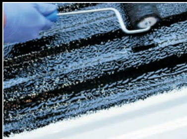
liberal rolling creates the texture