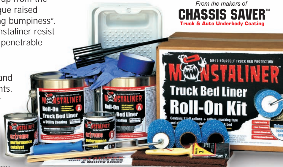
The BIG 2 Gallon Kit includes all tools needed for surface prep and installation.

From the makers of CHASSIS SAVER™ Truck & Auto Underbody Coating