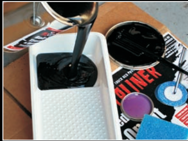
fill the roller pan