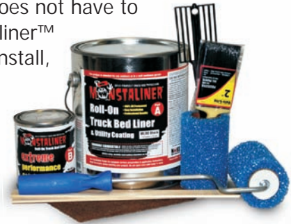
The 1 Gallon Kit includes rollers and basic tools

If you've done your bed liner homework, you've learned that professional spray-in liners like Rhino Linings or Line-X can cost more than you feel like spending but protecting your truck bed or jeep tub does not have to empty your pockets. Monstaliner™ is a highly durable, easy to install, do-it-yourself solution that provides truly professional looking results while costing hundreds less than expensive spray installations.