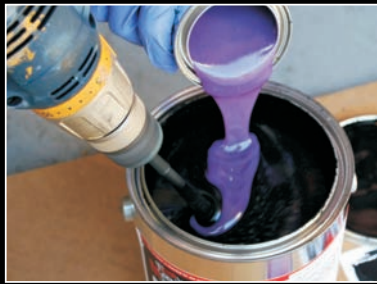
power mix components thoroughly