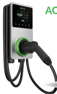
AC WALLBOX COMMERCIAL