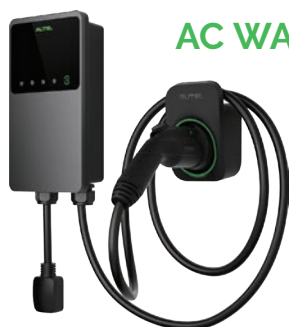
AC WALLBOX HOME